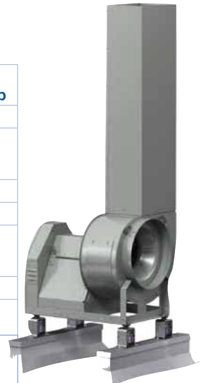
Belt drive FJC-300 with optional restrained isolators and equipment supports