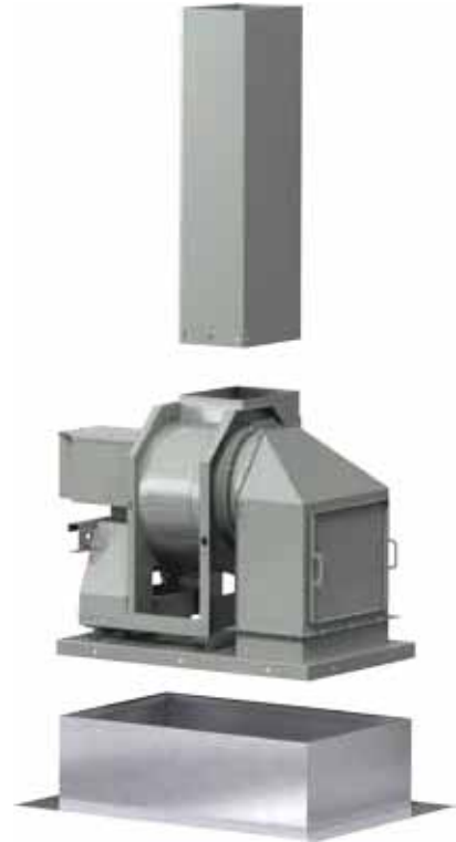
FumeJet with curb cap inlet box and GPFHL roof curb

Exploded views reflect shipping splits and minimal on-site assembly required for FumeJet systems.