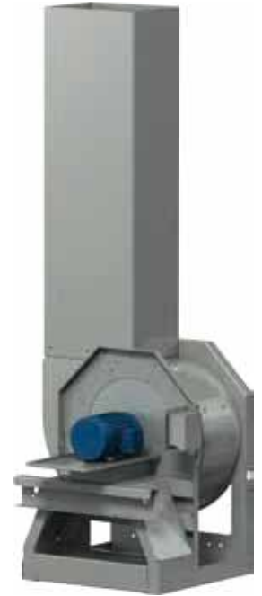
FJI Direct drive shown without motor cover