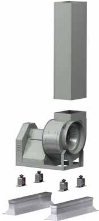
FumeJet with restrained isolators and GESS equipment supports

Greenheck's FumeJet systems are designed for quick installation and are pre-engineered to eliminate component misapplication and fit-up issues. FumeJet systems are designed for two installation types, equipment supports or roof curb mounted.