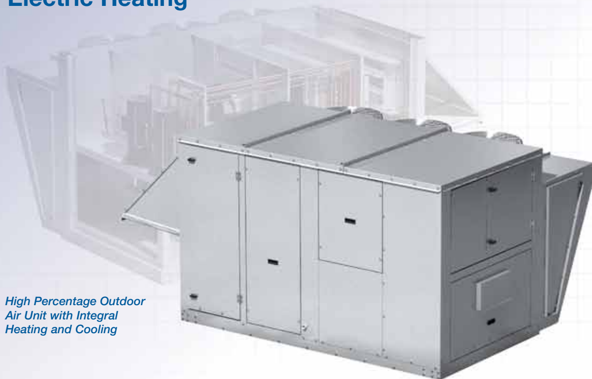
High Percentage Outdoor Air Unit with Integral Heating and Cooling

Providing the required amount of conditioned outdoor air to keep a building and the occupants healthy creates a serious challenge for any HVAC system. The model RV is a pre-engineered rooftop ventilation unit designed to answer that challenge by controlling the amount of outdoor and return air while fully tempering the supply air to desired conditions. The pre-engineered design ensures quality and consistency in this equipment and offers an economical alternative to custom-built products. Product sizing and selection is simplified by using Greenheck's Computer Aided Product Selection (CAPS) tool. CAPS provides fast turnaround for submittals, schedules and Revit files.